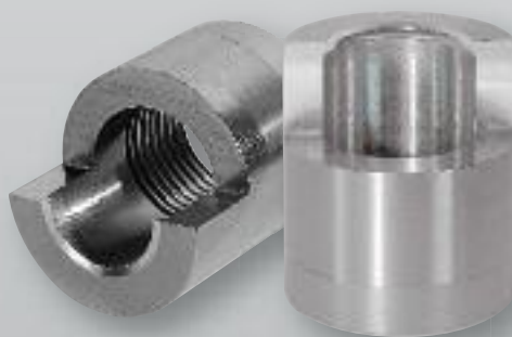
Weld-in sleeve LZE