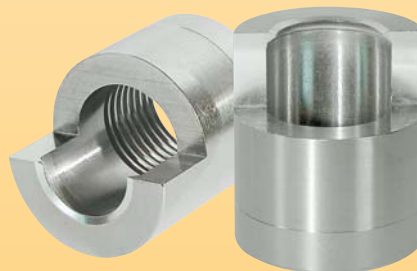
Weld-in sleeve LZE