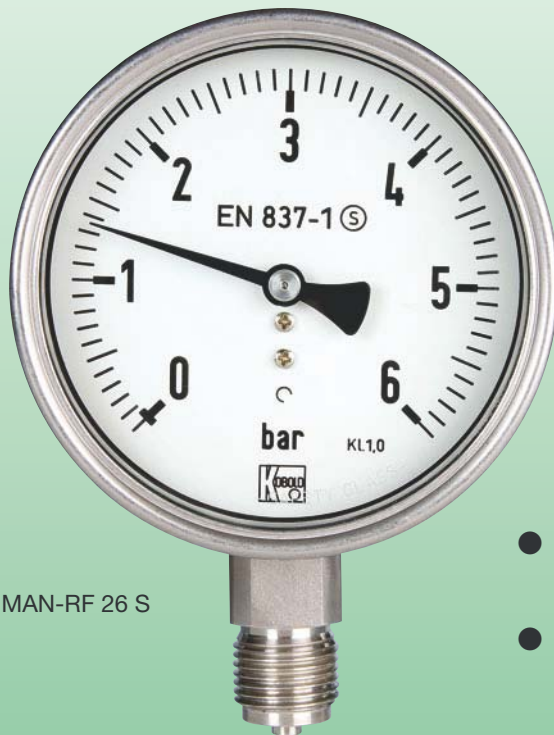
MAN-RF 26 S