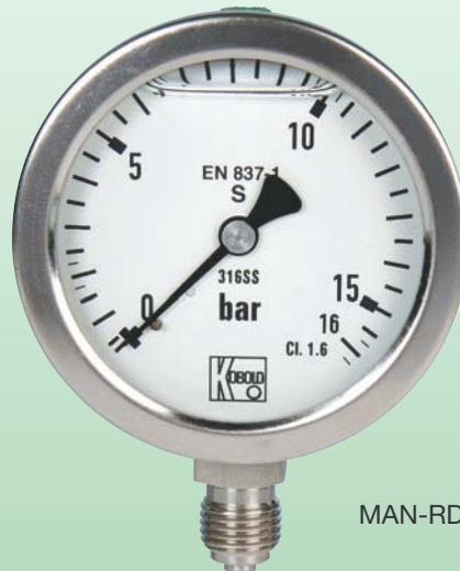
MAN-RD 25 S